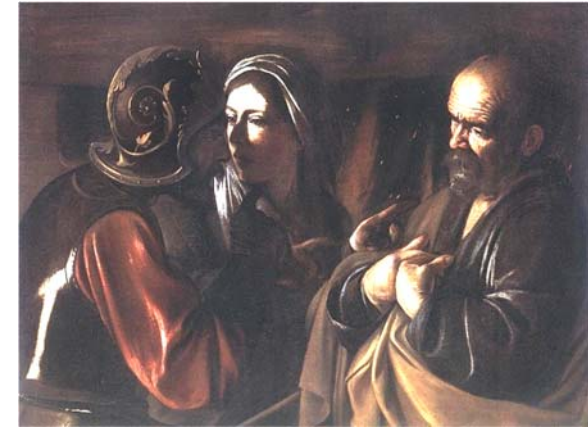
The Denial of Peter, 1610. Michelangelo Merisi da Caravaggio (1571–1610).

Mane autem factó, consili-um iniérunt omnes príncipes sacerdotum, et senióres pópuli advérsus Jesum, ut eum morti tráderent. Et vinc-tum addux-érunt eum, et tradidérunt Póntio Piláto práesidi. Tunc videns Judas, qui eum trádidit, quod damnátus esset, pœni-téntia ductus, rétulit triginta argéteos príncipibus sacerdotum et senióribus, dicens: S. Peccávi, tradens sánguinem justum. C. At illi dixerunt: S. Quid ad nos? Tu videris. C. Et projectis argéteis in templo, recessit: et ábiens, láqueo se suspéndit. Príncipes autem sacerdotum, accéptis argén-teis, dixerunt: S. Non licet eos mittere in córbonam: quia prétium ságuinis est. C. Consilio autem ínito, emérunt ex illis agrum figuli, in sepul-túram peregrinórum. Propter hoc vocátus est ager ille Hacéldama, hoc est, ager ságuinis, usque in hodiérnum diem. Tunc implétum est, quod dictum est per Jeremíam prophétam, dicéntem Et ac-cepérunt triginta angéteos prétium appetiáti, quem appretia-vérunt a filiis Israél: et dedérunt eos in agrum figuli, sicut constituit mihi Dóminus.