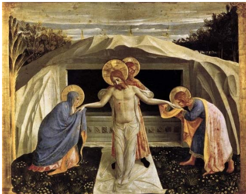
Entombment of Christ, 1438-40. Fra Angelico (c.1395 - 1455).

PER HUIUS, Dómine, operatióne mystérii: et vítia nostra purgéntur, et justa desidéria compleántur. Per Dóminum nostrum ...