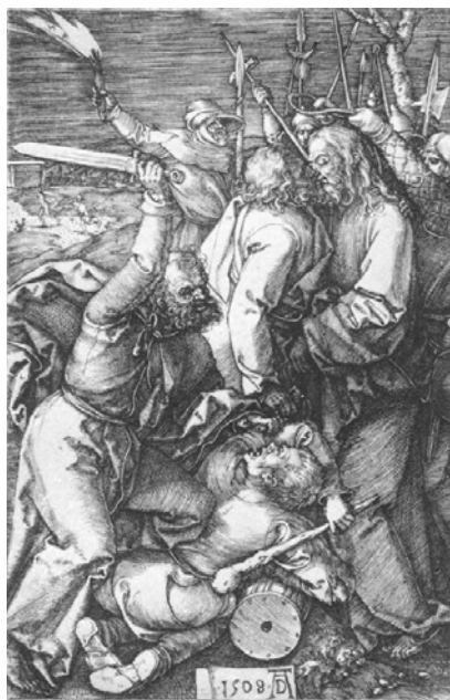
Betrayal of Christ, 1508. Albrecht Dürer (1471-1528).

suam, orans, et dicens: ✠ Pater mi, si possibile est, tránseat a me calix iste. Verúm tamen non sicut ego volo, sed sicut tu. C. Et venit ad discípulos suos, et invénit eos dormiéntes: et dicit Petro: ✠ Sic non potuístis una hora vigiláre mecum? Vigiláte, et oráte ut non intrétis in tentatió nem. Spíritus quidem promptus est, caro autem infirma. C. Iterum secúndo áblit, et orávit, dicens: ✠ Pater mi, si non potest hic calix transíre, nisi bibam illum, fiat volúntas tua. C. Et venit iterum, et invénit eos dormiéntes: erant enim óculi eórum graváti. Et relictis illis, iterum ábiit, et orásvit tertio, eúmdem sermónem dicens. Tunc venit ad discípulos suos, et dicit illis: ✠ Dormíte jam, et requiés cíte: ecce appropinquávit hora, et Fílius hóminis tradétur in manus peccatórum. Súrgite, eámus: ecce appropinquávit qui me tradet.