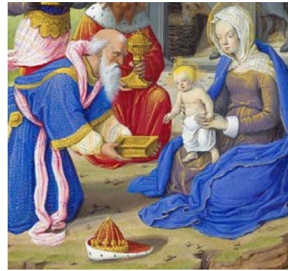
And falling down they adored Him.

Illustration: Adoration of the Magi (detail), from The Hours of Henry VIII by Jean Poyer (d. 1503)