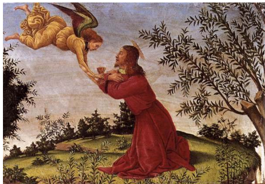
Agony in the Garden (detail), c.1500. Sandro Botticelli (c.1445-1510). Cover: The Last Supper , 1308-11. Duccio di Buoninsegna (c.1255-c.1319).

THEY parted my garments amongst them, and upon my vesture they cast lots.